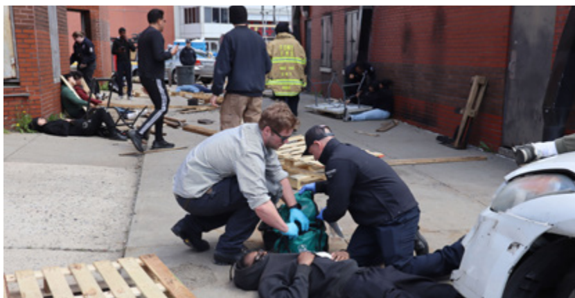
LaGuardia Paramedic students participate in FDNY Medical Search and Rescue Conference, posing as trauma victims during the training.

Sep 3 - Jan 15 (66 sessions/208 hours) Mon (9:30 am - 4:30 pm), Wed (1:00 pm - 5:00 pm) + 2 Sun (9:30 am - 4:30 pm) $1,690 EMTB100F25.T11.01.00 (18 clock hours/average class hours per week)