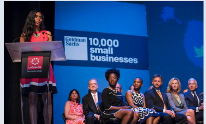
Small Business & Entrepreneur Services

Resources and support for small businesses, startups and entrepreneurs to grow your companies and be successful.